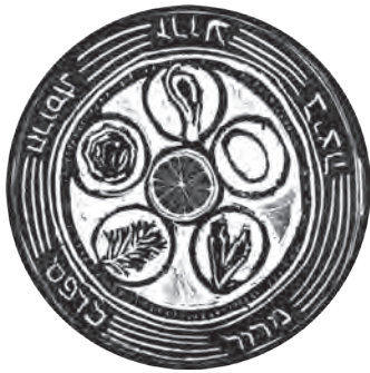
Artwork: Shlomit Segal