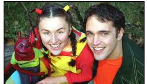
"Toronto's #1 Children's Entertainers" City Parent Magazine